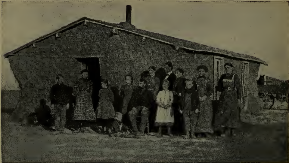
SOD SCHOOL BUILDING.

Often, indeed, the raising of the flag was followed directly by school improvement of an immediately practical sort. A flag went to a school in Sheridan County, Nebraska; it literally could not be raised, for within a radius of many miles in that dry and treeless region there was nothing which could serve as a pole